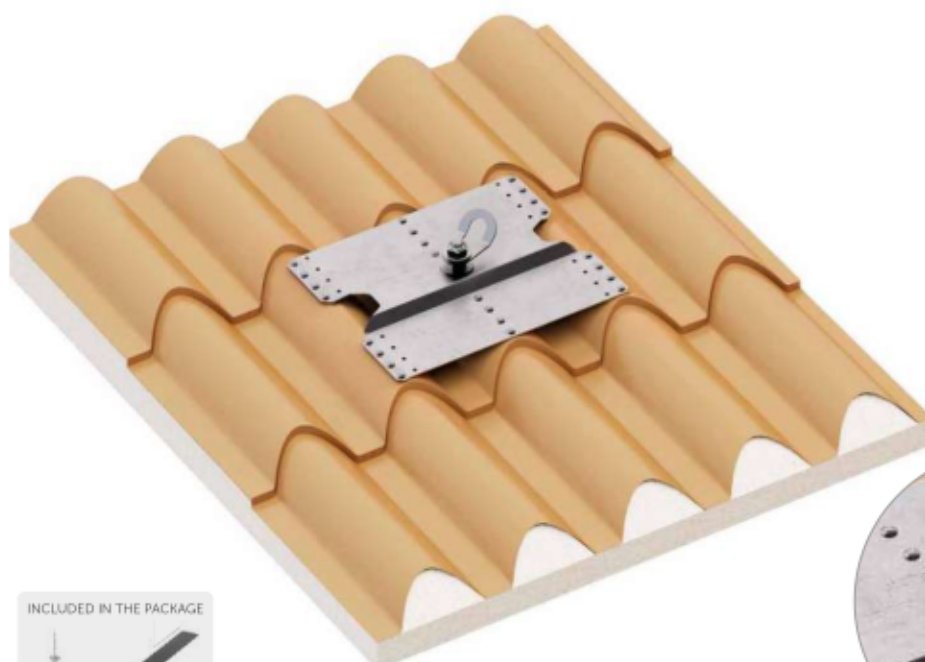
INCLUDED IN THE PACKAGE