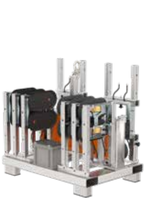
TRANSPORT FRAME Easy to transport (optional)