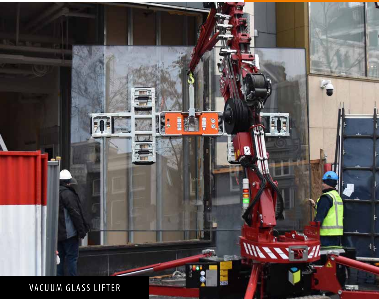
VACUUM GLASS LIFTER

FLAT GLASS LIFTING AND PLACING UP TO 1.000 KG